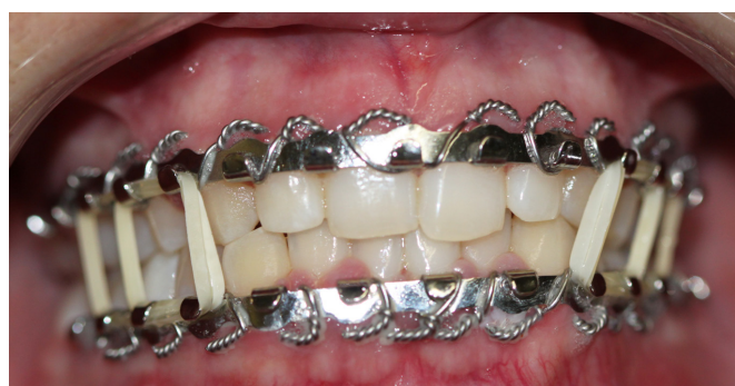
Figure 1. Restriction of mouth opening using Erich bars and elastic.

Postoperative complications can be associated with the extraction of third molars. Infection, nerve injuries, mandibular fractures, emphysema and temporomandibular disorders are complications that can require a new intervention 1,2 . Extraction of third molars has been identified as a risk factor for temporomandibular joint disorders 3-7 . Prolonged mouth opening during extraction can cause pain, stretch the ligaments and displace the TMJ disc 3 ; however, recurrent luxation of