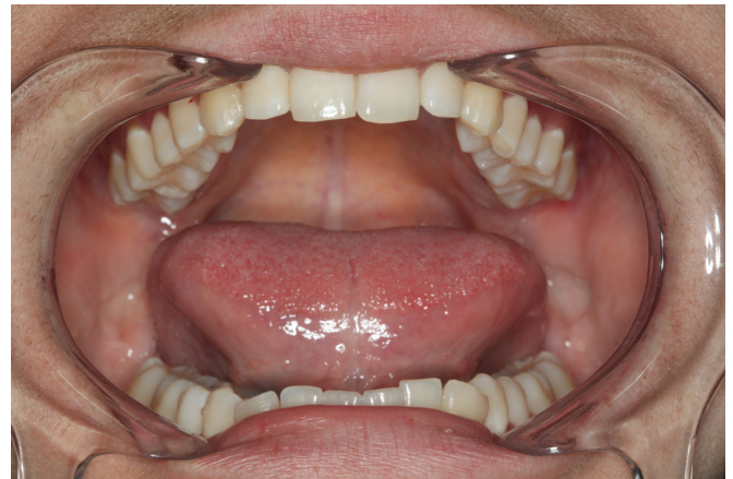
Figure 4. Maximum mouth opening showing proper joint function.

substances, as well as the use of maxillo-mandibular and occlusal splints. Conservative management is frequently the first choice, as in the present report; however, it is often ineffective. Regarding surgical treatment, eminectomy, oblique osteotomy of the